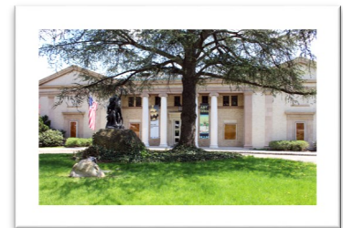
Montclair Art Museum